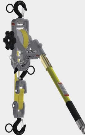
ZLH14447 2K HOT STICK OPERATED HOIST