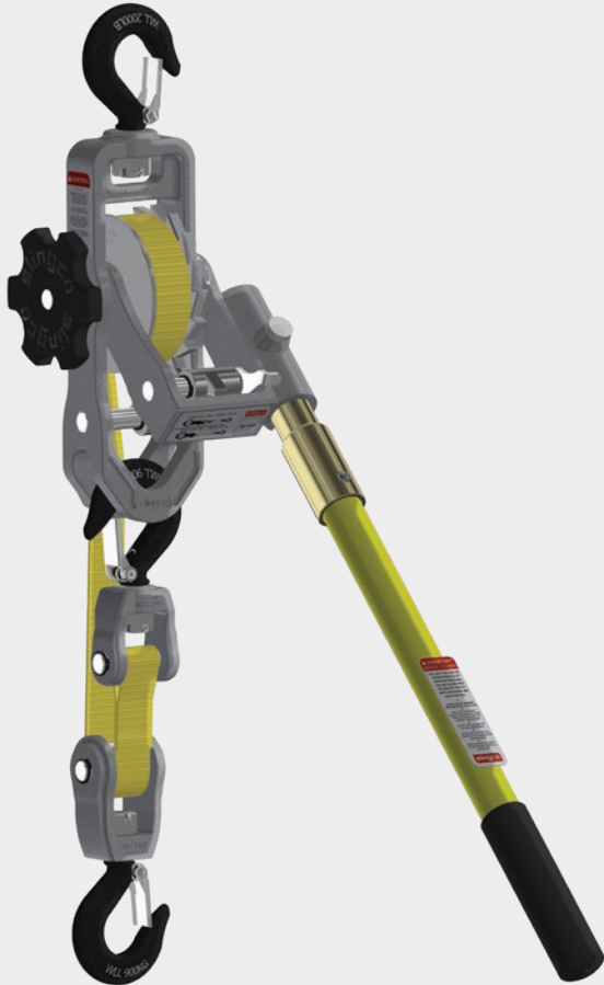
ZLH14321 2K HOIST