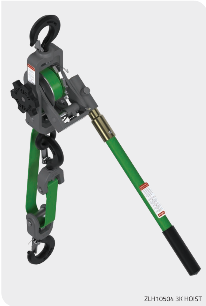
ZLH10504 3K HOIST